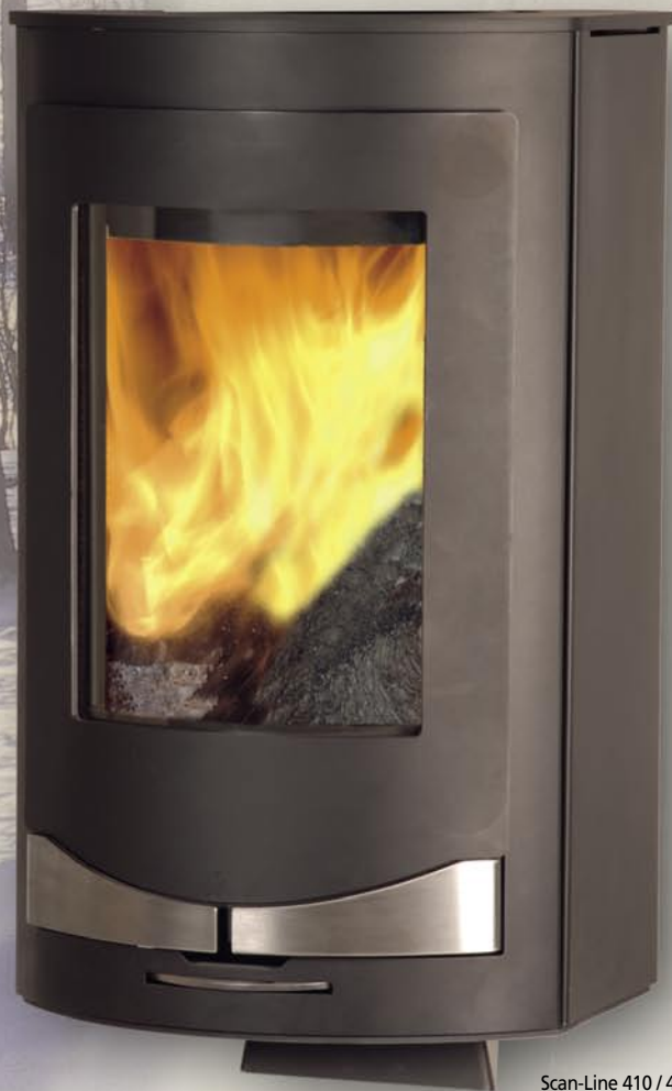
Scan-Line 410 / 411