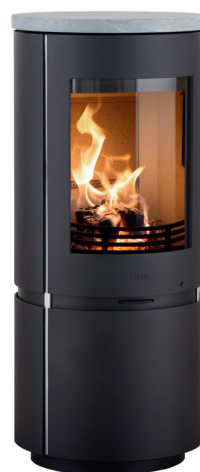
Scan-Line 8 cast iron, top in soapstone, with silver aluminium trim