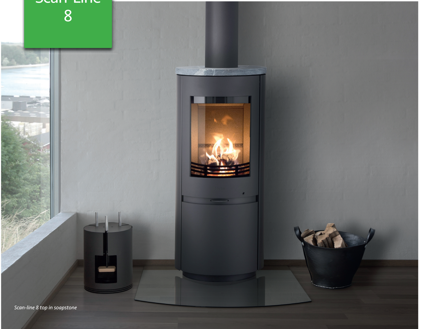
Scan-line 8 top in soapstone