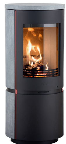
Scan-Line 8 complete soapstone, with red aluminium trim

Featuring a diameter of 44 cm and a height of 101 cm, the stove is so compact that it works well in many different rooms and types of housing.