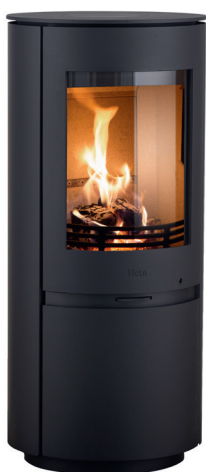
Scan-Line 8 steel

For further information and nearest dealer, visit www.heta.dk