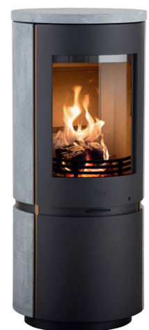
Scan-Line 8 complete soapstone, with copper aluminium trim