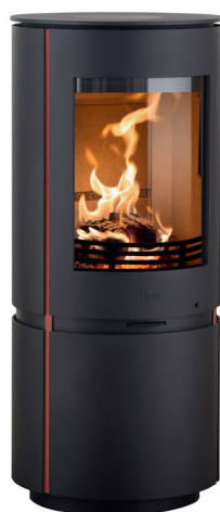
Scan-Line 8 cast iron, with red aluminium trim